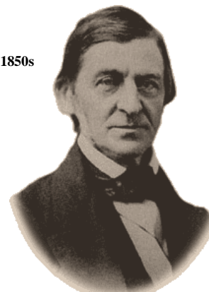
Emerson in the 1850s

In 1851 he began a series of lecture which would become The Conduct of Life , published in 1860. He was vigorous in middle age, traveling frequently, but was increasingly aware of his limits and failing energy. He had become quite famous, a major figure in the American literary landscape, a celebrity which brought both adulation and satire. He had been a profound inspiration for many writers, especially Henry Thoreau and Walt Whitman. He continued his speeches against slavery, but never with the fire of Theodore Parker. In 1857 he wrote an essay on "Memory" but ironically, in his later years, his own memory would falter, especially after his beloved house burned in 1872. He died quietly of pneumonia in 1882.